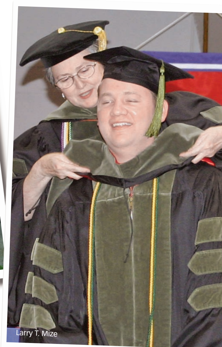
Larry T. Mize