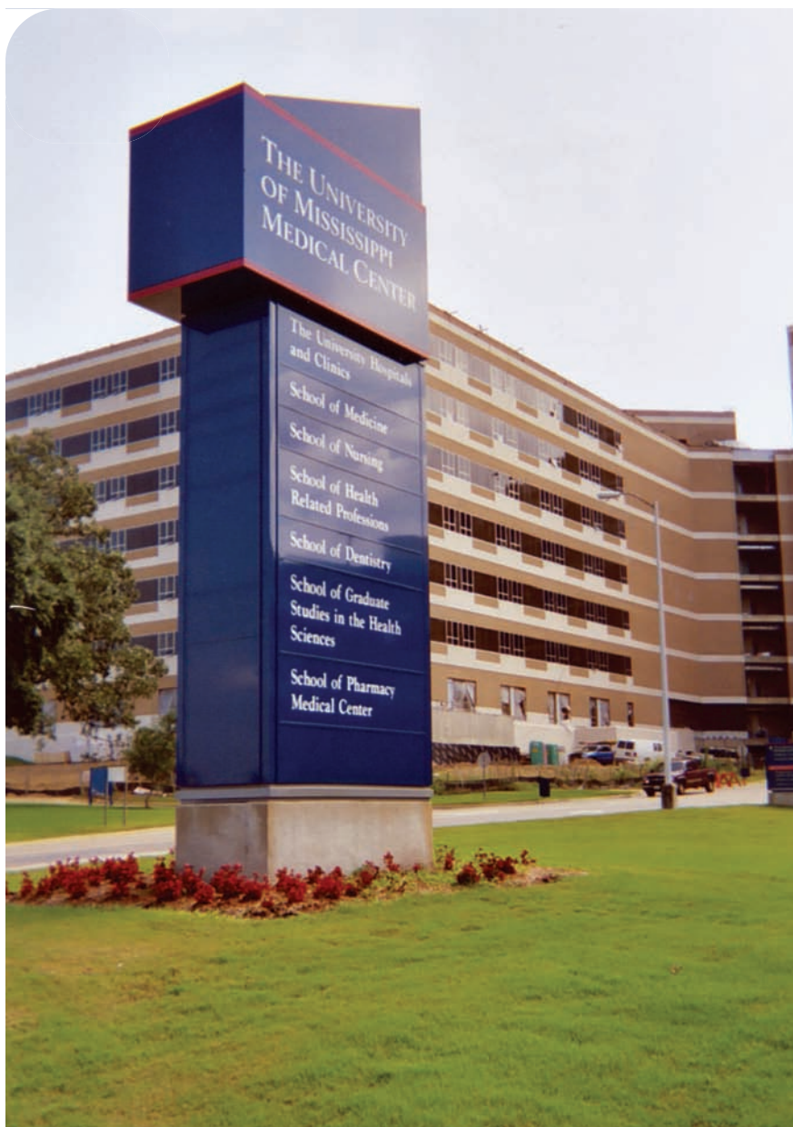
The University of Mississippi Medical Center in Jackson